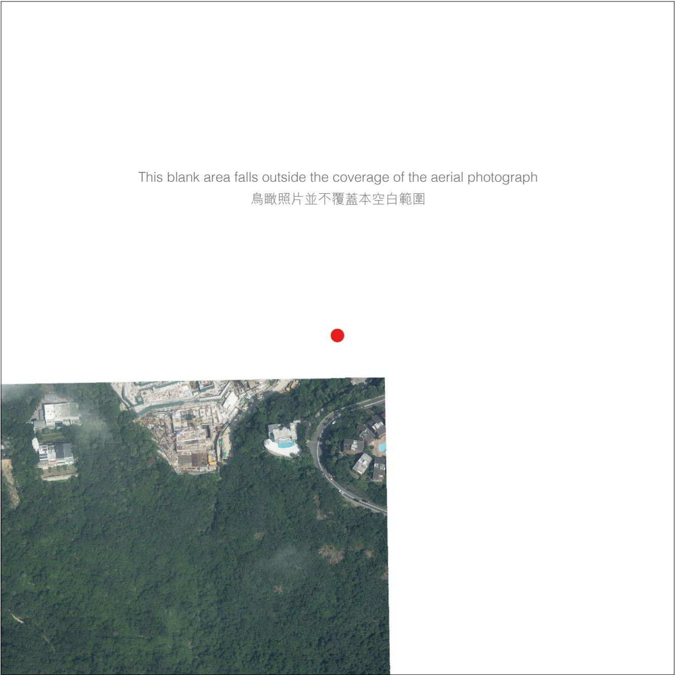
● Location of the Development 發展項目的位置

Extract from the aerial photograph taken by the Survey and Mapping Office of the Lands Department at a flying height of 6,000 feet, photo No.E071152C, dated 3 October 2019.